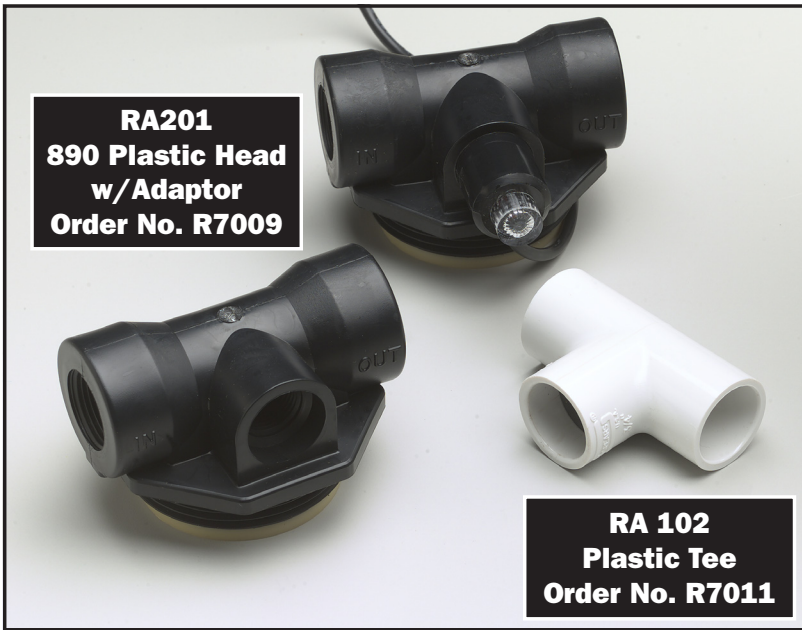
RA201 890 Plastic Head w/Adaptor Order No. R7009